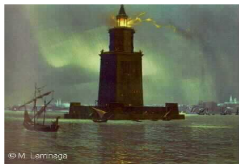
The beacon of Alexandria was buil in the 3<sup>rd</sup> centuryB.C.Between the 12<sup>th</sup> and the 13<sup>th</sup> century,due to Earthquakes it was destroyed.