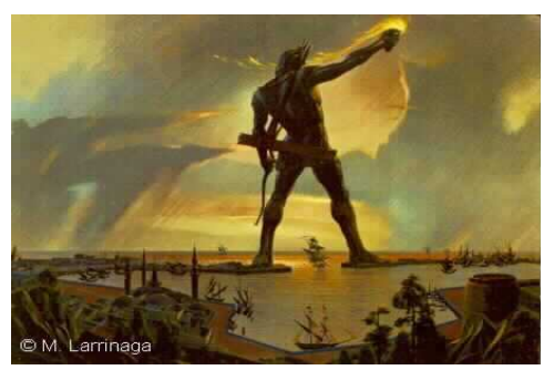
The Colossus of Rhodos was a huge bronze statue which Represents Helios the God of the Sun and was built at The beginning of the 3<sup>rd</sup> century B.C.