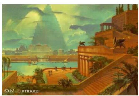
Suspended Gardens of Seramide were built by Seramida the legendary queen of Babylon.