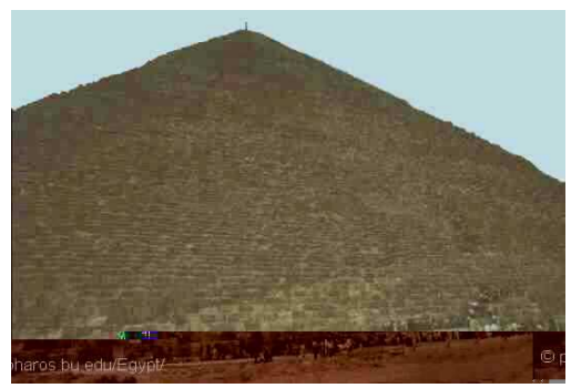
The Pyramids are architectural monuments of the Egyptian world which were built by Keops, Kephren, and Mykerinos, and are considered to be one of the seven wonders of the world.