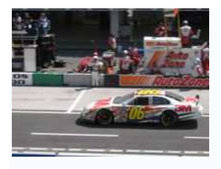
NASCAR Ford Fusion race car

Ford is a major player in the scene of auto racing and motorsports.