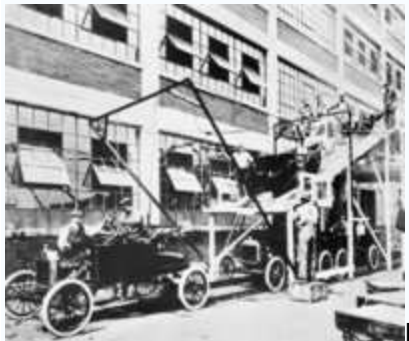
Ford assembly line (1913)

Productivity soared and employee turnover plunged, and the cost per vehicle plummeted. Ford cut prices again and again and invented the system of franchised dealers who were loyal to his brand name. Wall Street had disagreed with Ford's generous labor practices when he began paying workers enough to buy the products they made.