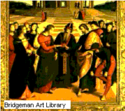
Bridgeman Art Library